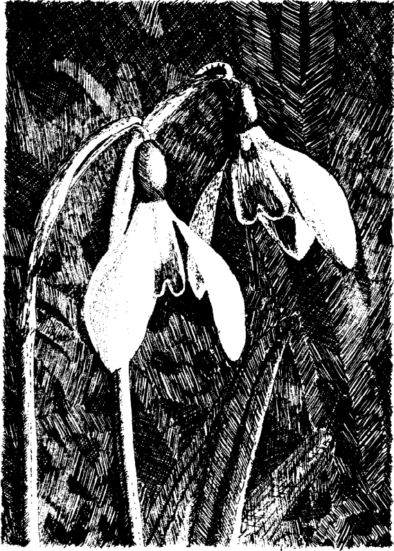
Wieb Patberg 1984 Saxifraga nivalis Ets 5/50